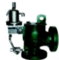
Pilot Operated Safety Valves Flowsafe