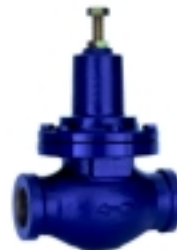
Sustaining Valves Type A, Type D, Type 9