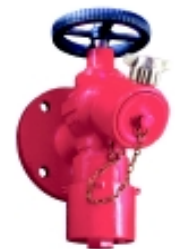
Fire Fighting Hydrant Reducing Valves