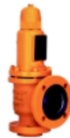
Safety relief valves to API and ASME - Type 3500