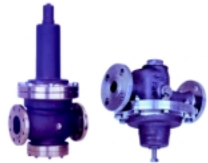
Reducing Valves A, AB, CL, CN, CH, D, B2